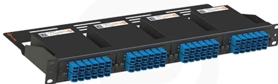
MDP PANEL EQUIPPED WITH FOUR, 24-PORT LC UPC MPO DISTRIBUTION MODULES